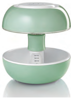
● light green