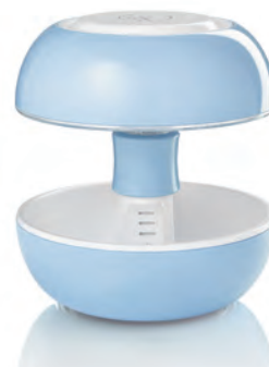
● light blue